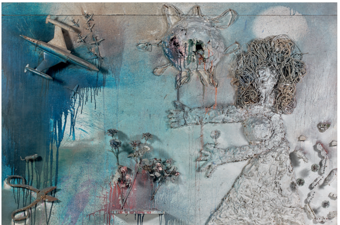
Niki de Saint Phalle, Tir Avion, 1961