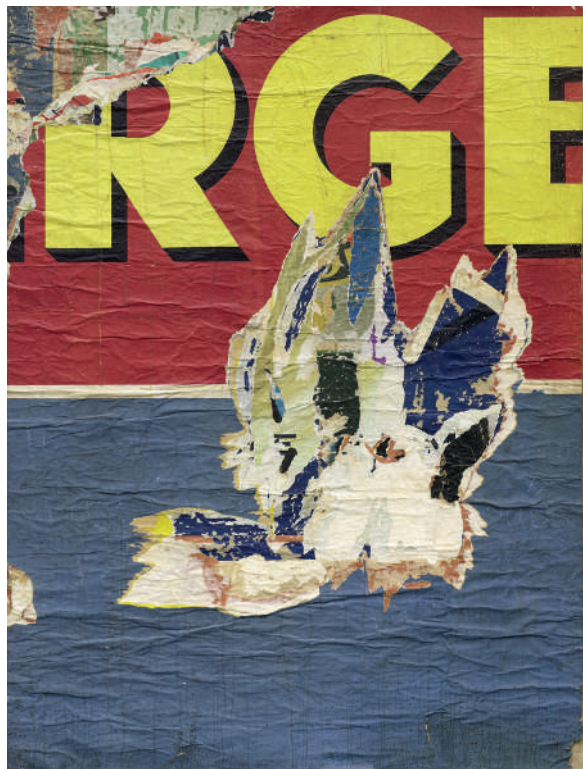
Jacques Villeglé, Avenue de l'observatoire, 1961

To use today's term, they were recycling. And they were trying to answer this question: what else can we do, which is not imposed on us, with the Real that we cannot escape? It is this realisation - that we cannot escape it - which is truly "Realist". (...)