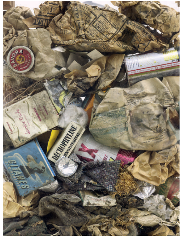
Arman, Déchets Bourgeois (detail), 1959

The New Realists found much of their raw material, which they used or abused, at flea markets, in car scrapyards, on waste ground and along the board fences erected to conceal waste ground from view, and even in convenience stores and "pound shop" type stores. However, the ultimate aim of their actions was not to deny reality.